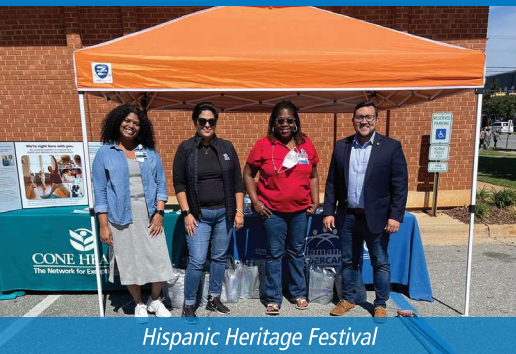
Hispanic Heritage Festival